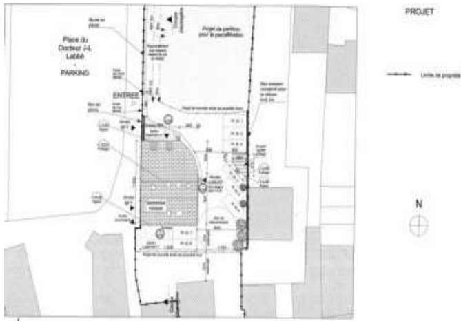
Plan masse et plan de toiture - Ech.: 1/250