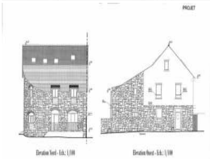
Elevation Nord - Ech.: 1/100