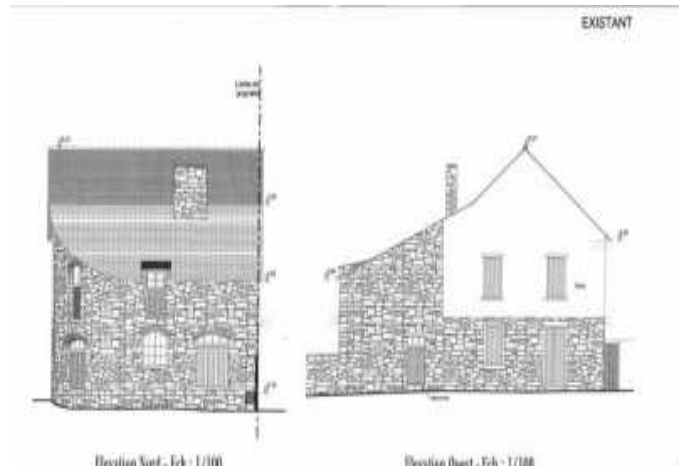
Elevation Nord - Ech.: 1/100