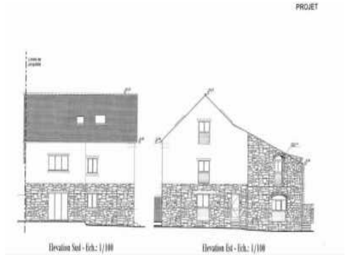
Elevation Sud - Ech.: 1/100