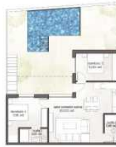
P0 / GROUND FL.