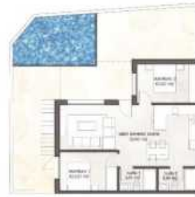
P8 / GROUND FL.