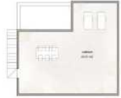
P1 / FRIT FL.