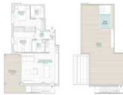
Solarium | Solarium