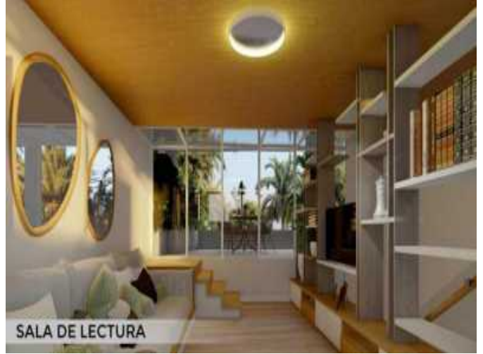
SALA DE LECTURA