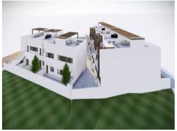
VIVIENDA TIPO Nº16 - 3 DORMITORIOS