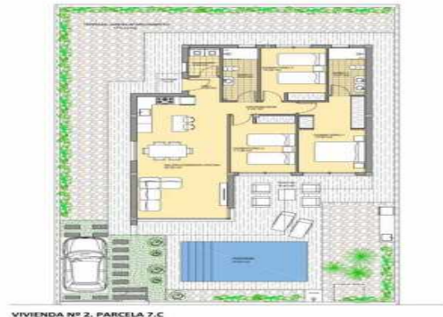
VIVIENDA Nº 2. PARCELA 7.C