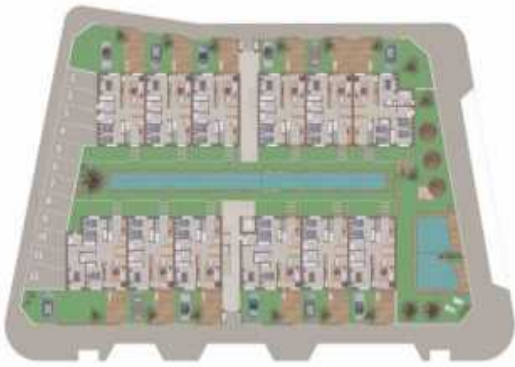
Planta segunda / Ground floor