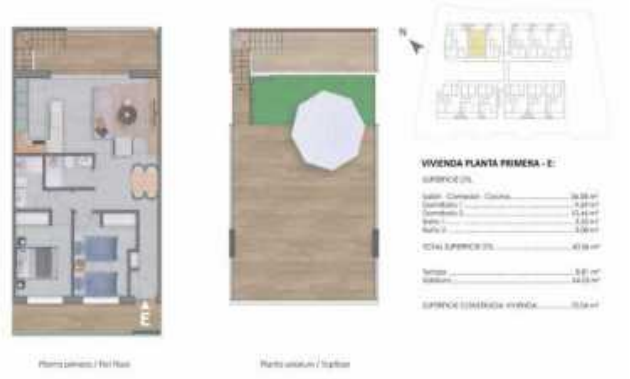
Planta primera / First floor