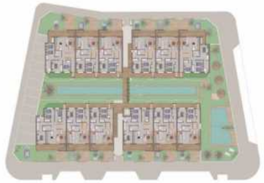
Planta primera / First floor