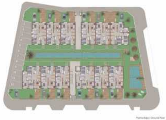
Figure 10-10 Ground Floor