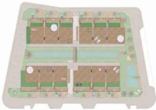
Plantilla / Ground Floor