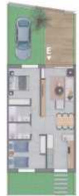
Plantilla / Ground Floor