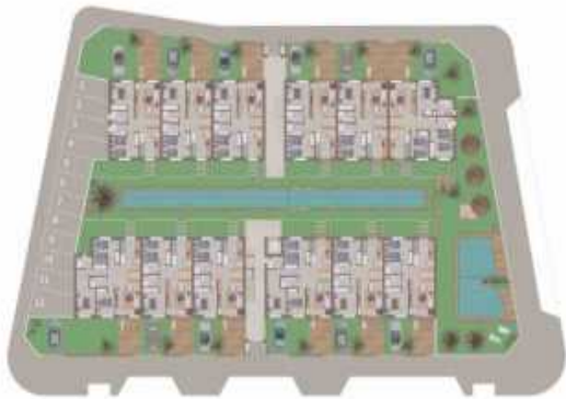
Plantilla / Ground Floor