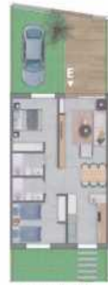
Plantilla / Ground Floor