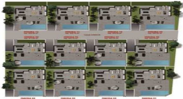
PLANTA BAJA GENERAL (1/250)