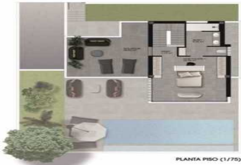
PLANTA PISO (1/75)