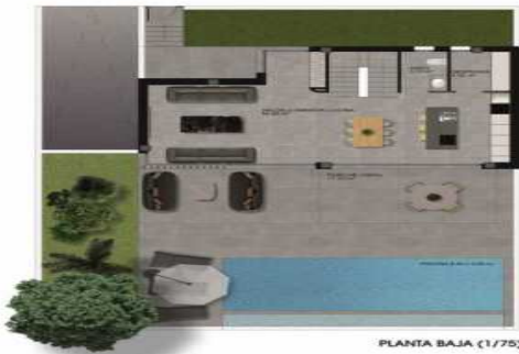
PLANTA BAJA (1/75)