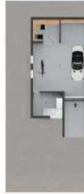
Alto / Superior 1. Garage 2. Living 3. Kitchen 4. Bed 5. Bath 6. Terrace