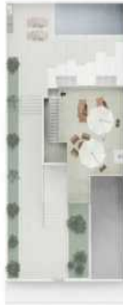
Solarium / Sunroom 1. Living 2. Dining 3. Kitchen 4. Terrace 5. Staircase 6. Garage 7. Storage 8. Utility 9. Bath 10. Bed 11. Bed 12. Bed 13. Bed 14. Bed 15. Bed 16. Bed 17. Bed 18. Bed 19. Bed 20. Bed 21. Bed 22. Bed 23. Bed 24. Bed 25. Bed 26. Bed 27. Bed 28. Bed 29. Bed 30. Bed 31. Bed 32. Bed 33. Bed 34. Bed 35. Bed 36. Bed 37. Bed 38. Bed 39. Bed 40. Bed 41. Bed 42. Bed 43. Bed 44. Bed 45. Bed 46. Bed 47. Bed 48. Bed 49. Bed 50. Bed 51. Bed 52. Bed 53. Bed 54. Bed 55. Bed 56. Bed 57. Bed 58. Bed 59. Bed 60. Bed 61. Bed 62. Bed 63. Bed 64. Bed 65. Bed 66. Bed 67. Bed 68. Bed 69. Bed 70. Bed 71. Bed 72. Bed 73. Bed 74. Bed 75. Bed 76. Bed 77. Bed 78. Bed 79. Bed 80. Bed 81. Bed 82. Bed 83. Bed 84. Bed 85. Bed 86. Bed 87. Bed 88. Bed 89. Bed 90. Bed 91. Bed 92. Bed 93. Bed 94. Bed 95. Bed 96. Bed 97. Bed 98. Bed 99. Bed 100. Bed