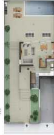
Planta Baja / Ground Floor 1. Living 2. Kitchen 3. Garage 4. Staircase 5. Hallway 6. Bathroom 7. Bedroom 8. Terrace 9. Garden 10. Pool 11. Parking 12. Storage 13. Utility 14. Laundry 15. Storage 16. Storage 17. Storage 18. Storage 19. Storage 20. Storage