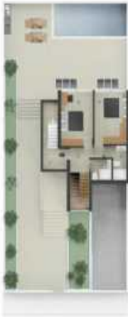
Primo Planta / First Floor 1. Living 2. Kitchen 3. Garage 4. Staircase 5. Hallway 6. Bathroom 7. Bedroom 8. Terrace 9. Garden 10. Pool 11. Parking 12. Storage 13. Utility 14. Laundry 15. Storage 16. Storage 17. Storage 18. Storage 19. Storage 20. Storage