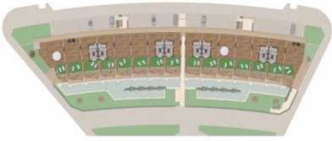
Planis de la section transversale