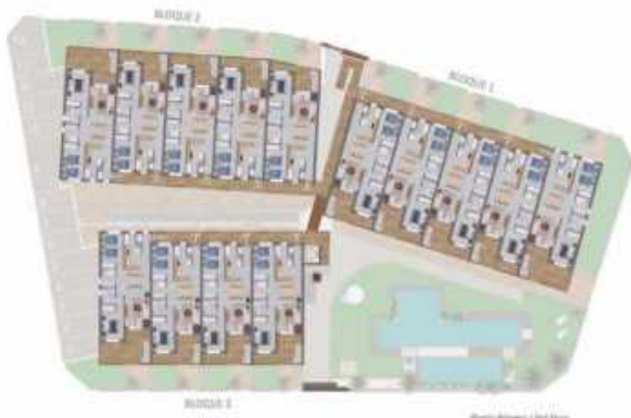
Parks Preserve / First Floor