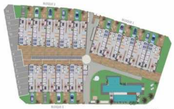
Planta Ajed. / Ground Plan