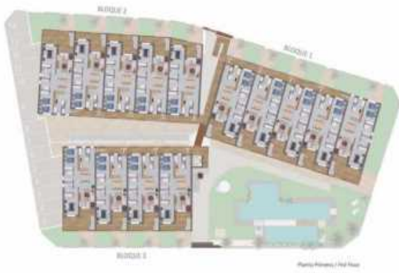
Parks Preserve / First Phase