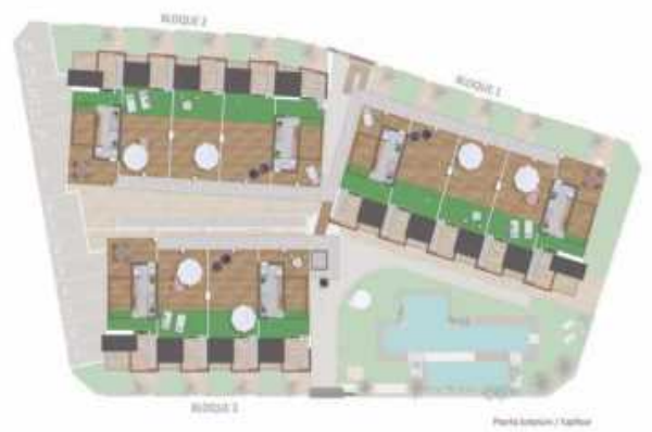
Parkside Meadows / Park House