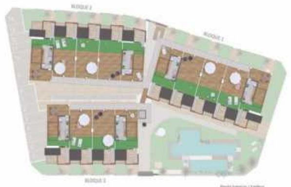
Parks Preserve / Upper Floor