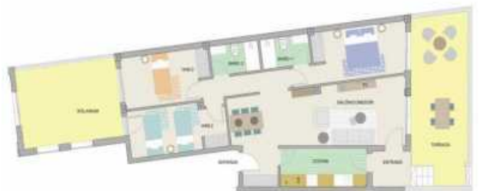
VIVIENDA BAJO A OPCIÓN 2