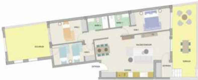
VIVIENDA BAJO A OPCIÓN 1