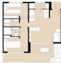
Residential Floor Plan - Single Unit (1/1/2025)