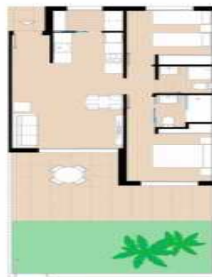
Ground Floor Plan - Unit 101