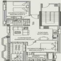
PLANTA BAJA LOW LEVEL

ÁTICO DUPLEX / DUPLEX PENTHOUSE 3 DORMITORIOS, 3 BEDROOMS PLANTA 01 / 01 st FLOOR ESCALERA 4 / STAIR 4