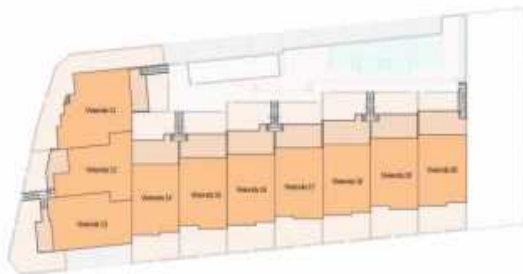
ISO A3 - Escala 1:250