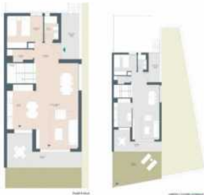
Model 02 - Tip 00 (1)