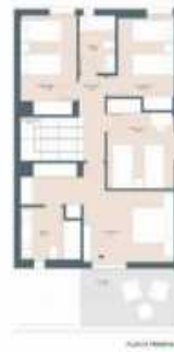
Model 02 - Tip 00 (1)