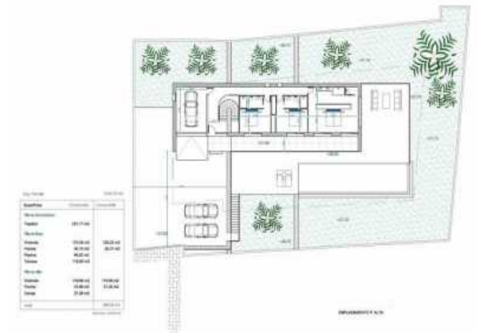
EMPLANTAMENTO 2 - 1/20