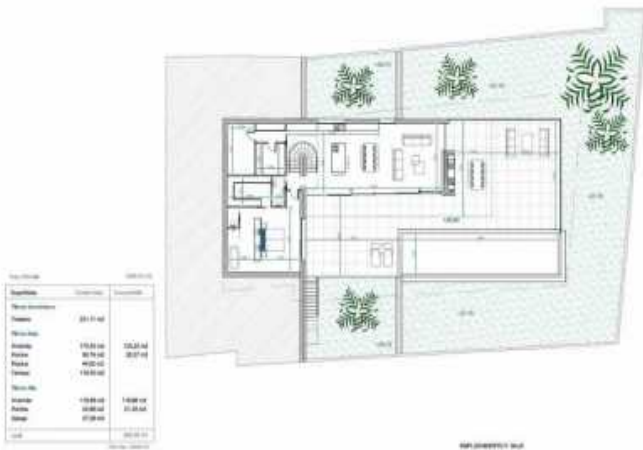
EMPLANTAMENTO 1 - 1/20