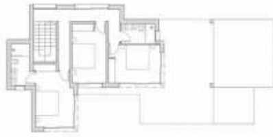
PLANO PLANTA PRIMERA DISTRIBUCION