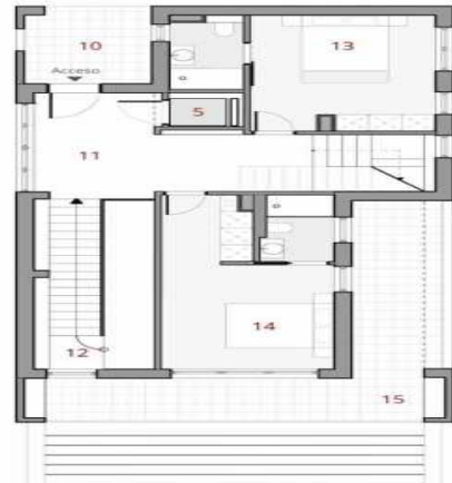
FIRST FLOOR HOUSE BUILT SURFACE (TERRACES ARE NOT INCLUDED) 72.43 m 2