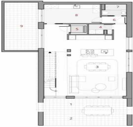
GROUND FLOOR HOUSE BUILT SURFACE (TERRACES ARE NOT INCLUDED) 17.40 m 2