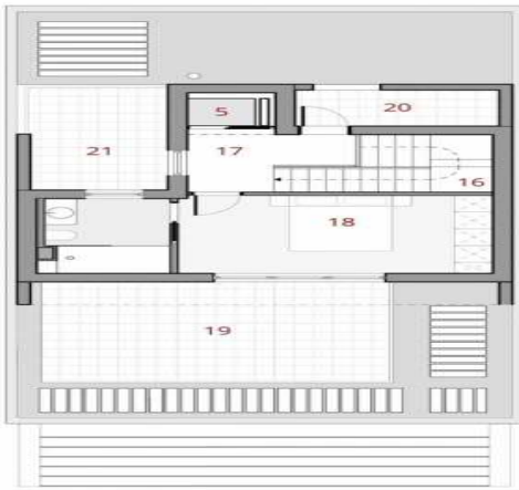
SECOND FLOOR HOUSE BUILT SURFACE (TERRACES ARE NOT INCLUDED) 37.67 m 2