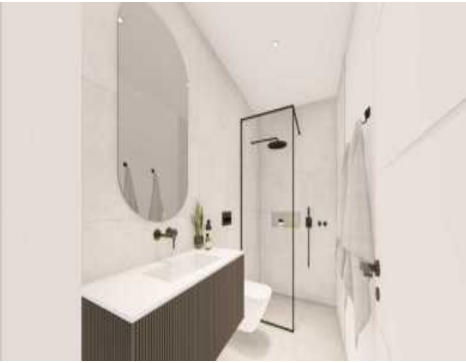
S IS SHARE THE PARTY AND