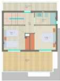
PLANTA ALTA TOP FLOOR