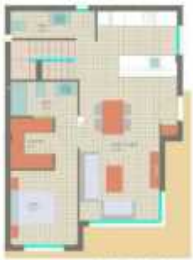
PLANTA BAJA GROUND FLOOR