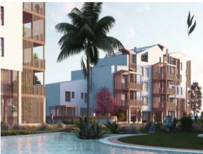
Terraza & Jardin Frontal | Front terrace & Garden