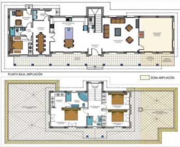
PLANTA PRIMERA AMPLIACION Escala 1:100