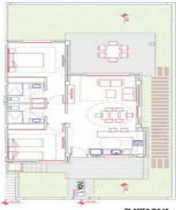
VIVIENDA N°1 PL.BAJA