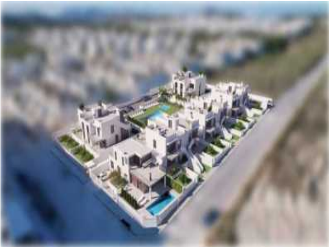
VIVIENDA N°4 PL.BAJA