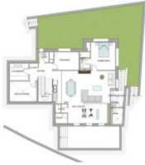
PARCELA 7.1 PLANTA SOTANO - DISTRIBUCION

0 1 2 3 4 5 6 7 8 9 10m Escala: 1:100 Superficie total: 265.15 m 2