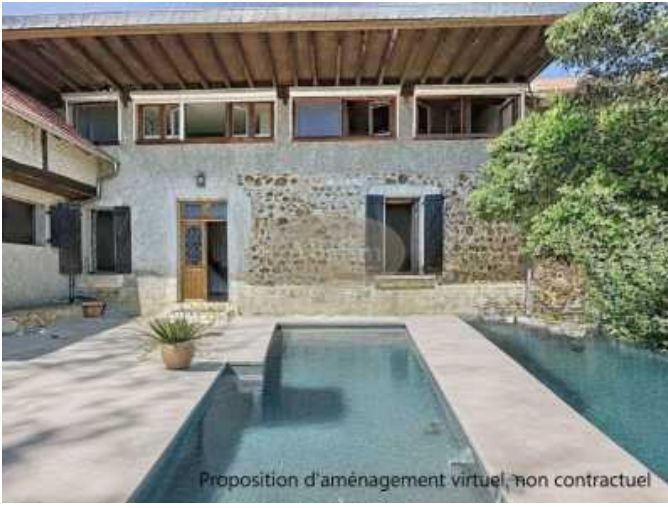
Proposition d'aménagement virtuel, non contractuel