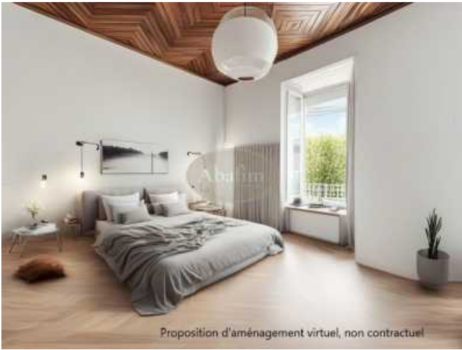
Proposition d'aménagement virtuel, non contractuel