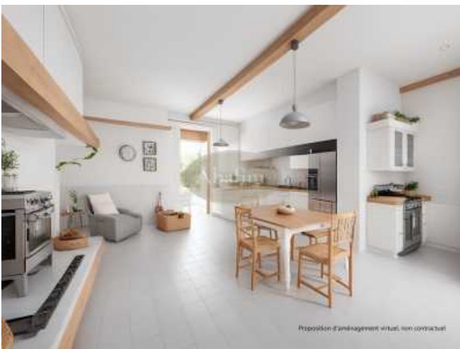
Proposition d'aménagement virtuel, non contractuel