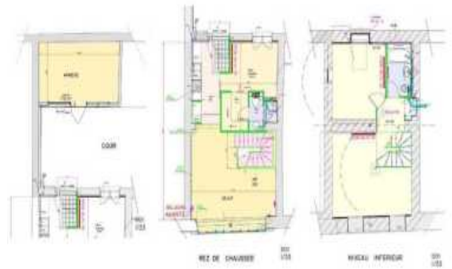
Document non contractuel