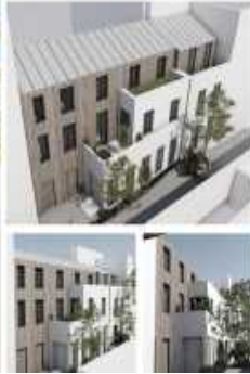
Surélévation d'un bâtiment en RDC