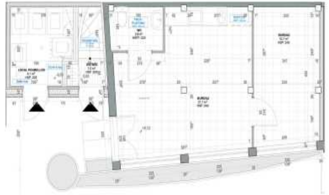
Document non contractuel