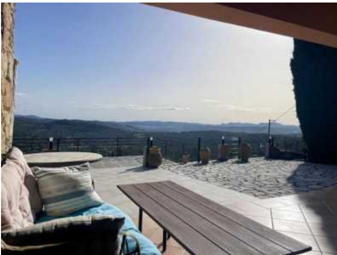
Rez de jardin