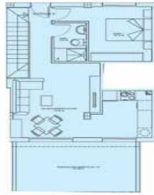
TIPO D ÁTICO

TIPO C TOTAL CONSTRUIDA: 82,39 TOTAL ÚTIL: 69,42