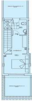
TIPO C ÁTICO

TIPO C PRIMERA PLANTA: Superficie construida: 62.53 m 2 Superficie útil: 50,82 m 2 TIPO C ÁTICO: Superficie construida: 22,84 m 2 Superficie útil: 18,77 m 2 TIPO C TOTAL CONSTRUIDA: 85,37 TOTAL UTIL: 69,59