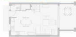
1000 sq. ft. Unit