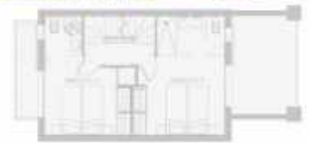
1200 sq. ft. Unit