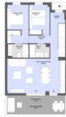
Unit 102 (sqm)