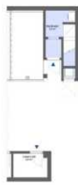
Unit 101 (sqm)