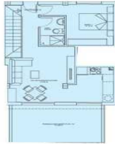
TIPO D ÁTICO

TIPO C: TOTAL CONSTRUIDA: 82.39 TOTAL ÚTIL: 69.42