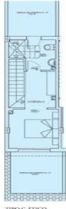
TIPO C ÁTICO

TIPO C PRIMERA PLANTA: Superficie construida: 62,53 m 2 Superficie útil: 50,82 m 2 TIPO C ÁTICO: Superficie construida: 22,84 m 2 Superficie útil: 18,77 m 2 TIPO C TOTAL CONSTRUIDA: 85,37 TOTAL UTIL: 69,59